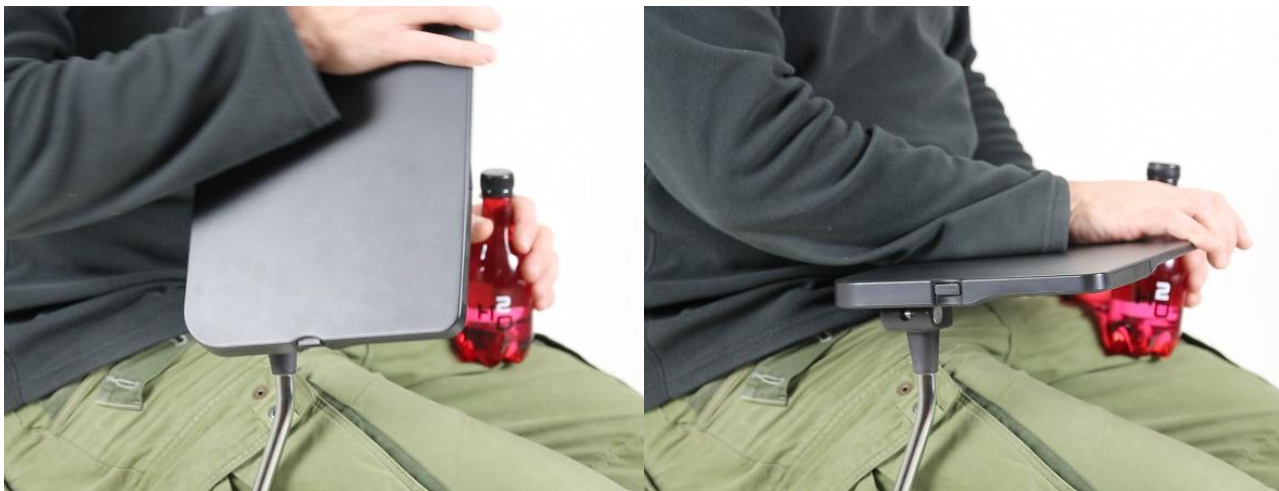
The tablet can be folded away