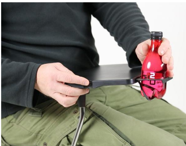
The tablet has an integrated cup holder