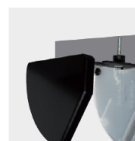
Mounting set for cabinet installation